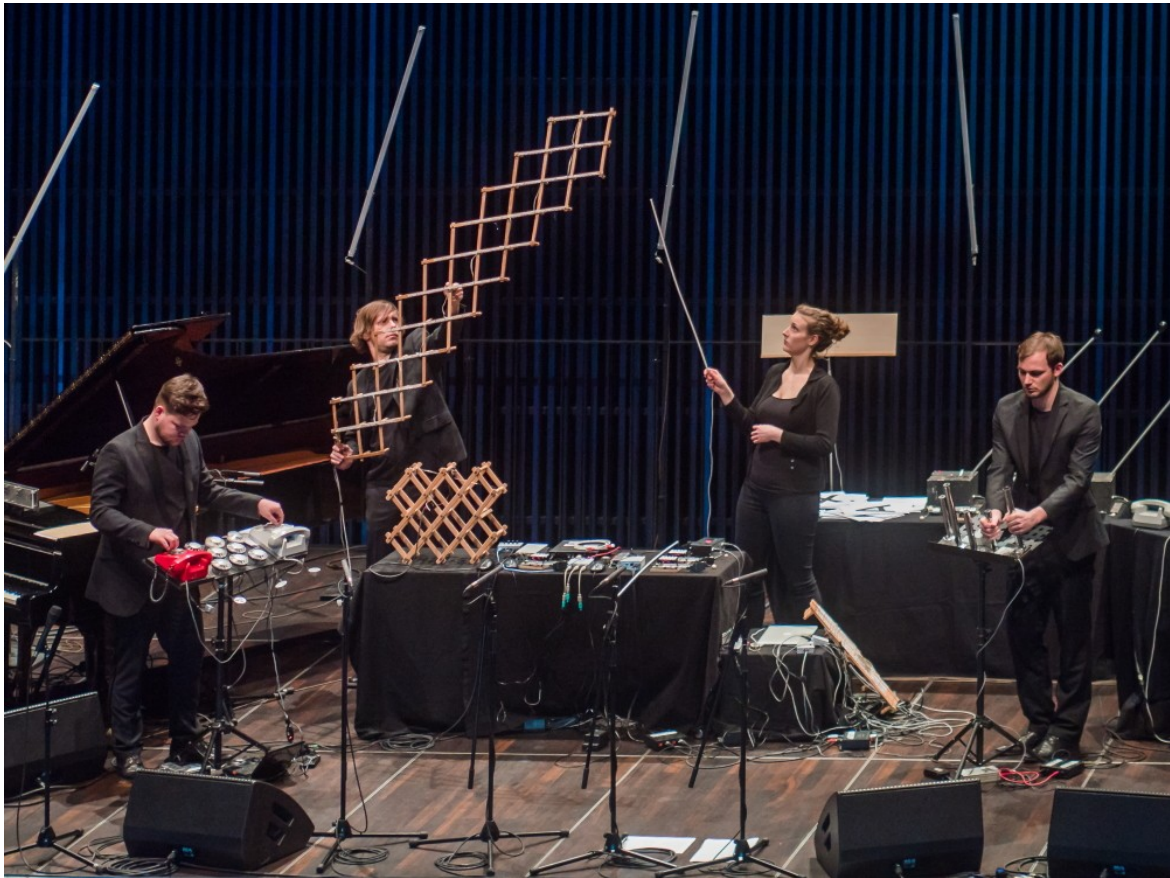
Typical concert setup consisting of instruments with various sensors, that measure contacts, the acceleration or the skin resistance. From left to right: Rotary Dial Drumset, Coatrack Guitar, Swinging Sticks, Kilo Ohm.

(Donaueschingen 2017,)