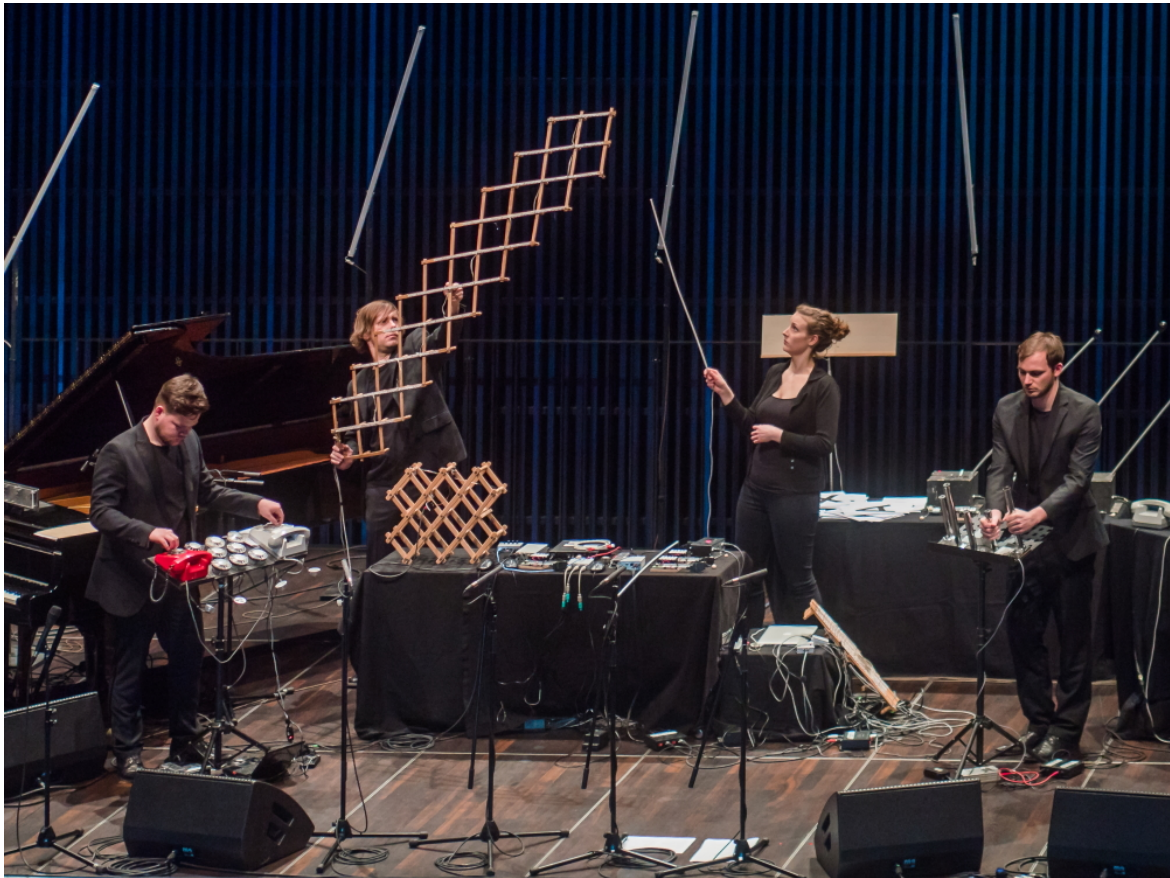
Typical concert setup consisting of instruments with various sensors, that measure contacts, the acceleration or the skin resistance. From left to right: Rotary Dial Drumset, Coatrack Guitar, Swinging Sticks, Kilo Ohm.

(Donaueschingen 2017,)