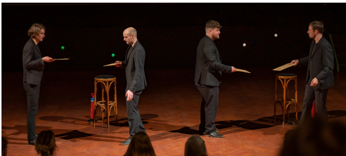
Table tennis balls are rhythmically juggled on tuned plywood boards.

(Donaueschingen 2017)