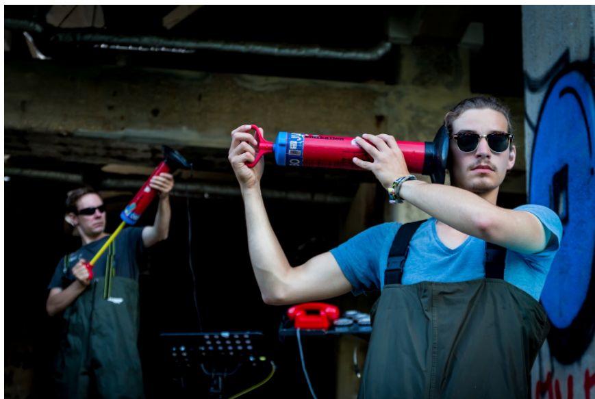
Rhythmic Suction Pump Performance.

(Leipzig 2015)